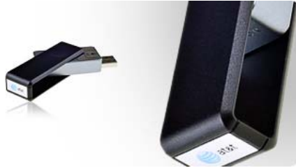
AT&amp;T USBConnect Quicksilver

The cards below will allow you to connect your laptop to the internet from anywhere you can get a cellular signal