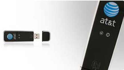
AT&amp;T USBConnect Mercury